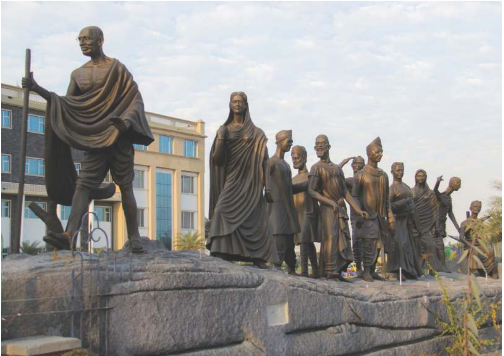
THE 11 MOORTI