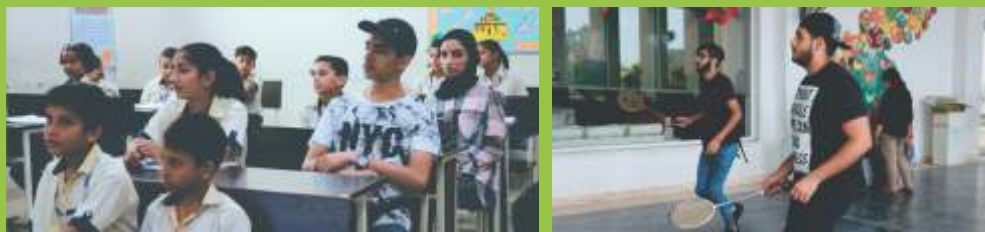
A GROUP OF STUDENTS FROM BAHRAIN VISITED SJIS ON 30 TH JULY, 2018