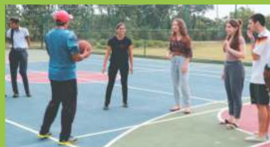
A GROUP OF STUDENTS FROM CANADA, CHINA, EGYPT & GEORGIA VISITED SJIS BETWEEN 15 TH TO 30 TH JULY, 2019