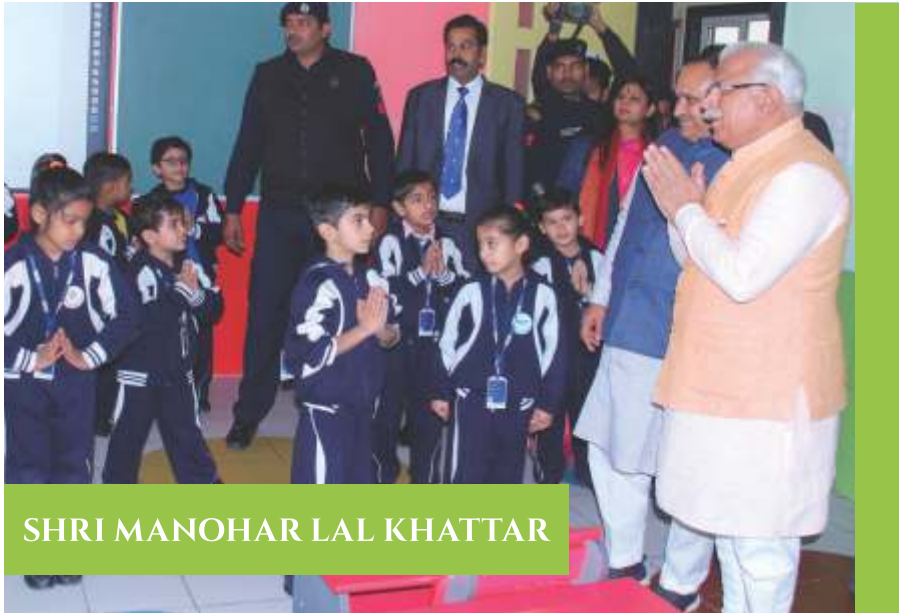
SHRI MANOHAR LAL KHATTAR