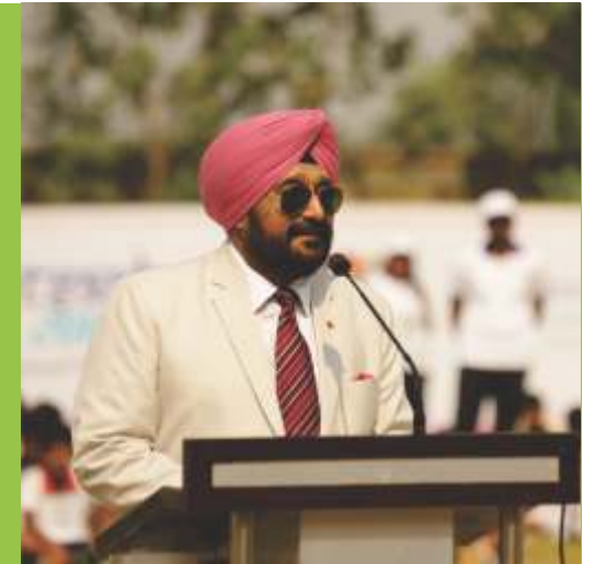
GENERAL BIKRAM SINGH FORMER CHIEF OF INDIAN ARMY