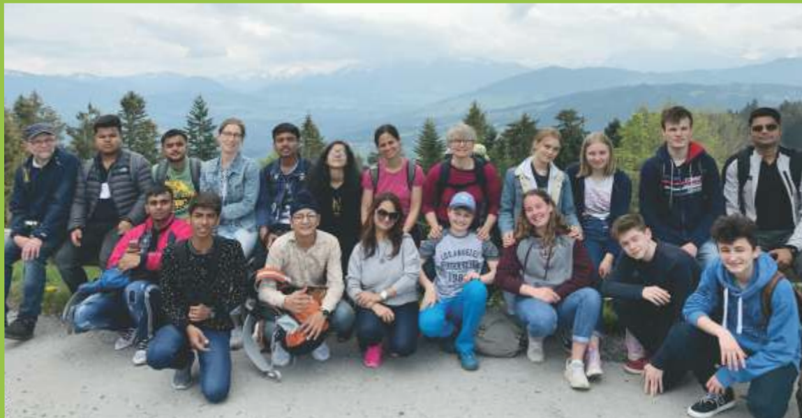
A GROUP OF STUDENTS FROM SJIS VISITED GERMANY BETWEEN 20 TH MAY TO 6 TH JUNE, 2019 FOR INDO-GERMAN CULTURAL EXCHANGE PROGRAMME