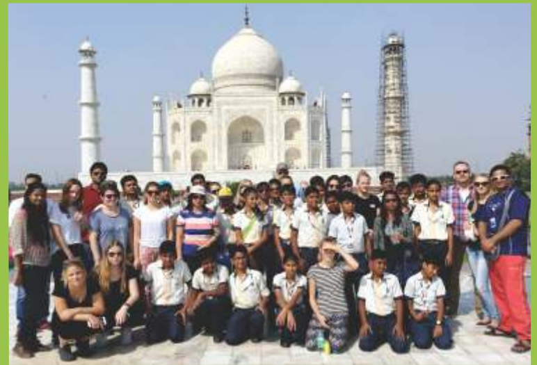
A GROUP OF STUDENTS AND TEACHERS FROM GERMANY VISITED SJIS BETWEEN 18 TH TO 20 TH OCTOBER, 2016 FOR INDO-GERMAN CULTURAL EXCHANGE PROGRAMME