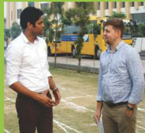
MR. MAX FROM UKRAINE VISITED SJIS ON 06 TH OCTOBER, 2017